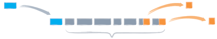
Fig. 3. Bitmixer stash, consisting a persons bitcoins (blue) and the anonymised bitcoins returned by Bitmixer.

a custom additional fee, in-out analysis of the Bitmixer reserve is prevented. In addition to that, Bitmixer uses a private ‘bitcode’ that identifies a batch of previously owned bitcoins by a user. This ensures that a user will never receive its previously owned bitcoins after processing by Bitmixer.