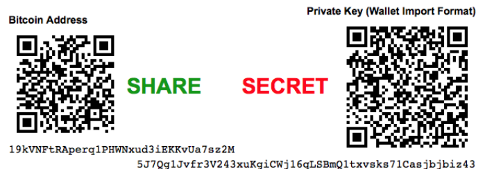
Fig. 2. Bitcoin wallet, consisting our of public and private component. Created using https://bitaddress.org

More secure methods of wallet creation are using self built versions of open source Bitcoin wallets Armory 9 or Electrum 10 on an offline machine that has never touched the internet directly.